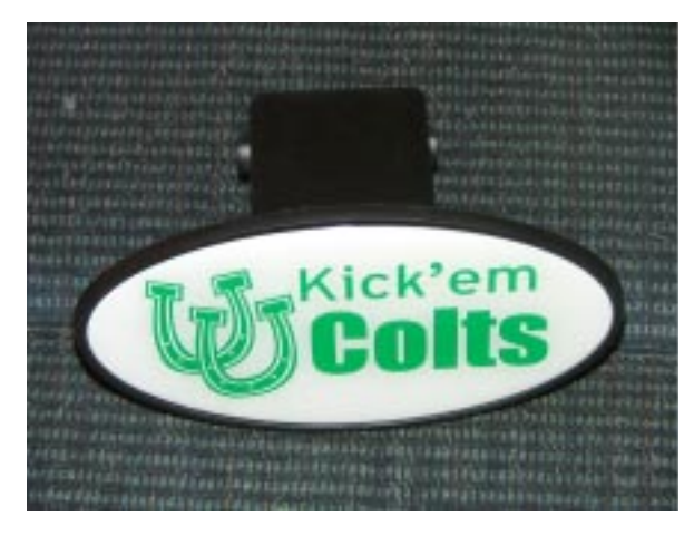
The AHS Alumni Band is selling 25-inch wooden yard art horseshoes for $25 plus oval-shaped AHS trailer hitch covers for $13.00 each. Horseshoes are painted green and white, water-proofed, with yard stick. Proceeds will purchase music, instruments and supplies needed to continue participating in the Alumni Open House, the July 4th parade, and the Parade of Lights in December.