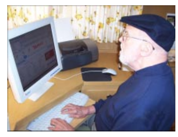
This grandfather wants a dual membership. DO YOU?

Our membership chairman will, in turn, send permission to the webmaster to honor your online membership request without additional fees. After March 1, you will be able to go to the website and sign on for online membership.