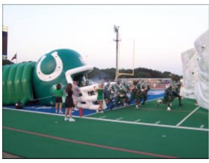
The Colts charging through the new inflatable run-through which we helped purchase.