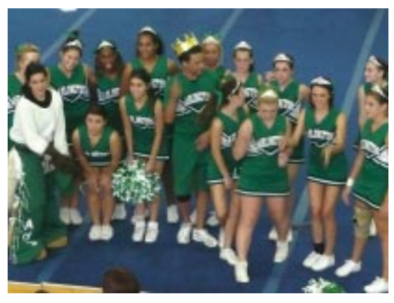
The cheerleaders gather for a photo op prior to the start of the pep rally.