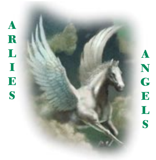
Give a gift membership TODAY!