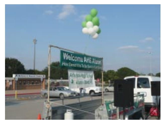
The banner and balloons invite all alumni to stop by for hot dogs, lemonade and fun.

Almost 200 hot dogs and gallons of lemonade refreshed the biggest ever crowd at the Association's Tailgate Party. Along with the Alumni Band , music maestro and DJ Floyd Wine , '63, provided music from decades past, as exes from all classes reunited.