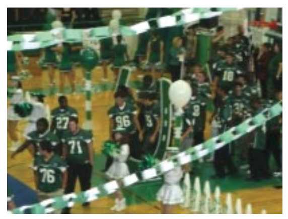
To start the pep rally, the team walks through the horseshoe to the strains of "Horse."

The spirit still runs high at AHS, especially at Homecoming when the gym is covered in green and white and the stands are filled with students and alumni.