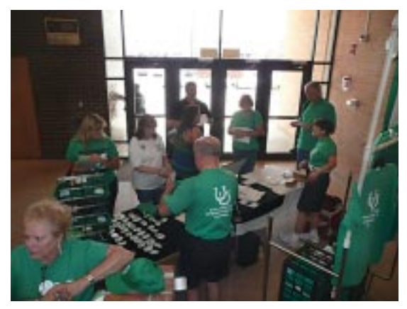
Association volunteers sell alumni products and promote membership in the gym foyer.