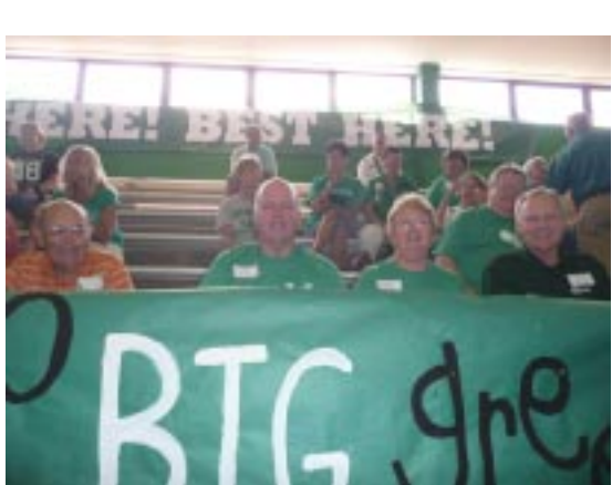
DCA honorees get frontline seats in the alumni section of the gym.