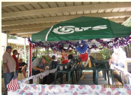
First ever Alumni float entry