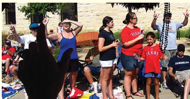
Colt hand sign on the float and in the crowd