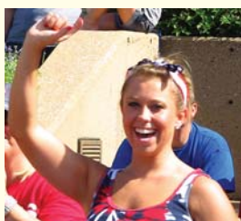
A smiling Colt