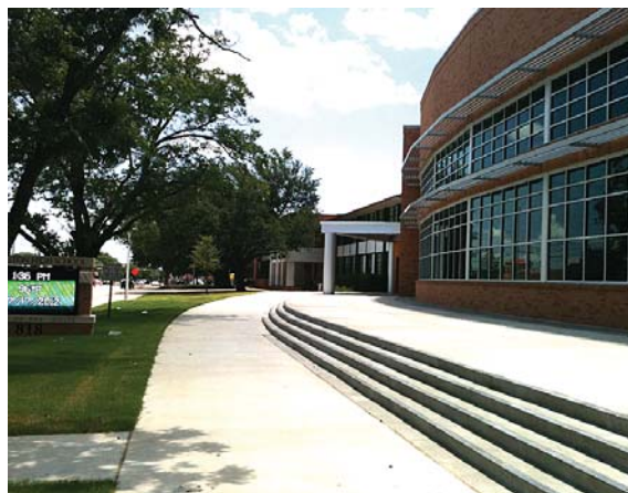
New marquee—which we helped fund—near new cafeteria on northwest corner of building.