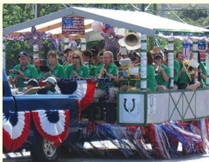
Alumni Band float