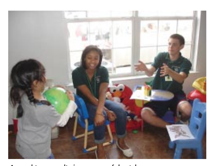
A good toss results in a successful catch.