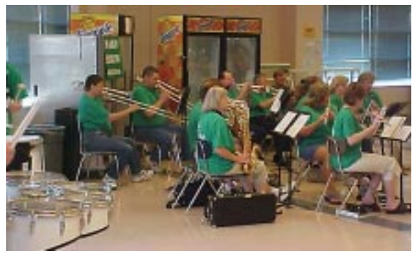
To join Alumni Band, see page 7