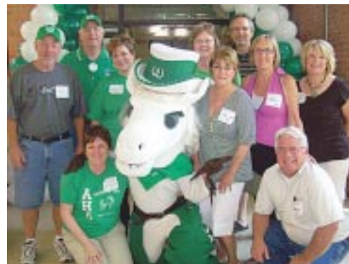
Class of 1970 reunion committee