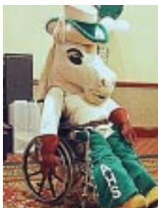
Lil "old" Arlie at '70 reunion