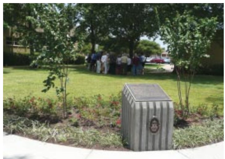
With the marker in the foreground, a group of friends of AHS attend the dedication.

designed and forged the plaque, generous alumni from AHS paid for the plaque, and UTA placed it on the concrete pillar and landscaped the area. It is a lovely, shady spot in the midst of the city and the campus. Now no matter what the future holds for the remaining buildings of the old complex, a monument stands as a reminder that in 1922 the first Arlington High School was the “largest public education facility between Dallas and Fort Worth.”