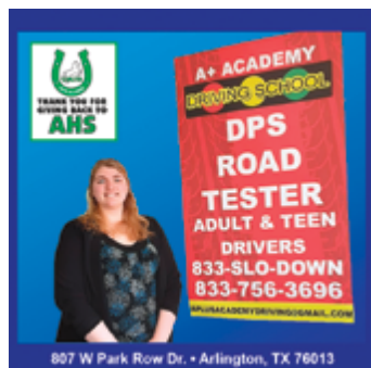
A+ DRIVING SCHOOL – COLT KICKER DONOR

(alumni sponsor), Pantego Café, Prespa's, Prosperity Bank, Rosa's Home Health Care, Upstairs Gallery (alumni sponsor) and Wade Funeral Home (alumni sponsor). Thank you for your support!