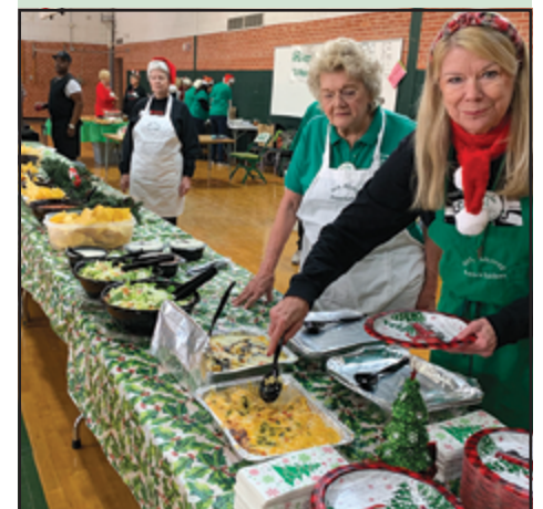
AHS Alumni Board members, team up with Colt Corral volunteers to assist with various activities throughout the year, including Teacher Appreciation lunches at the end of each semester.

Nominations open until the May 1 deadline. Honorees will be introduced at both the Homecoming pep rally and Open House. The decision of the Board shall be final.