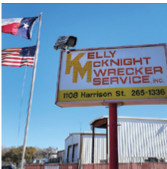
McKNIGHT WRECKER SERVICE - COLT STARS DONOR