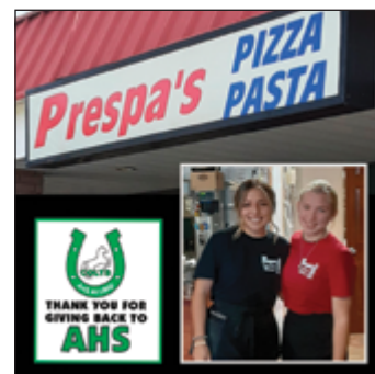
PRESPA'S – COLT KICKER DONOR