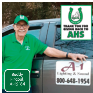
A-1 LIGHTING - ALUMNI SPONSOR