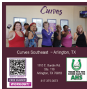
CURVES - SOUTHEAST - ALUMNI SPONSOR