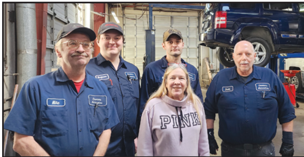
CHAMBERS AUTOMOTIVE - ARLIE'S ANGEL ALUMNI SPONSOR

Chambers Automotive is our lone Arlie's Angel Sponsor. Arlie's Angels include those sponsors who have donated between $301-$499. We are honored to have Chambers Automotive be an alumni sponsor!