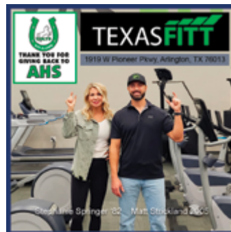
TEXAS FITT - ALUMNI SPONSOR