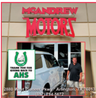
McANDREW MOTORS - COLT STARS DONOR