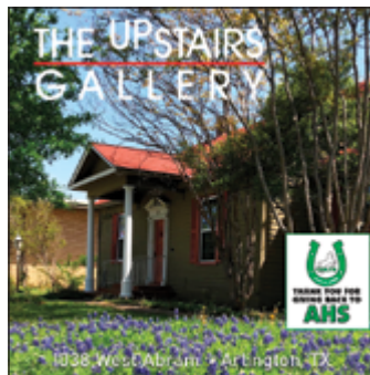
UPSTAIRS GALLERY – ALUMNI SPONSOR