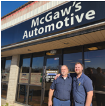
McGAW'S AUTOMOTIVE - ALUMNI SPONSOR