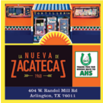
LA NUEVA DE ZACATECAS - COLT STARS DONOR