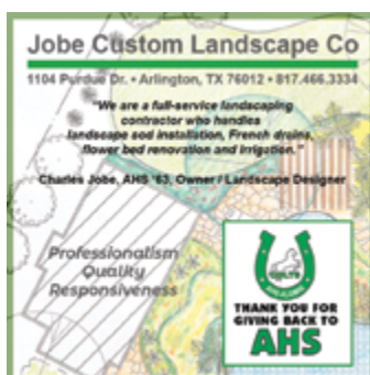
JOBE CUSTOM LANDSCAPE – ALUMNI SPONSOR