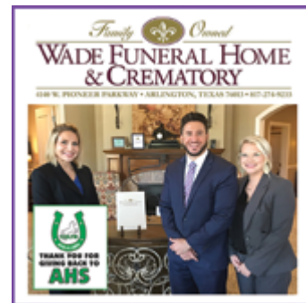
WADE FUNERAL HOME – ALUMNI SPONSOR