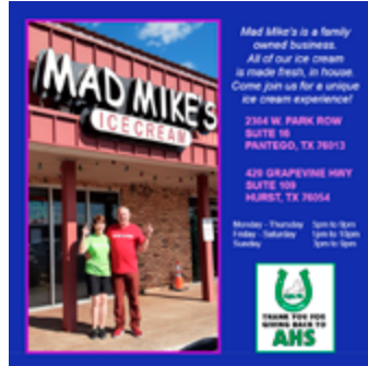
MAD MIKE'S - COLT STARS DONOR