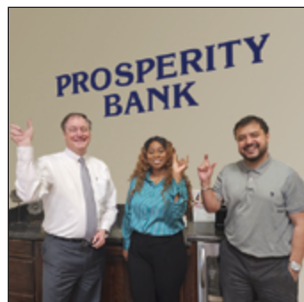
PROSPERITY BANK – COLT KICKER DONOR