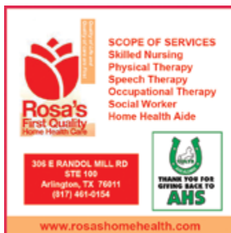
ROSA'S HOME HEALTH CARE – COLT KICKER DONOR